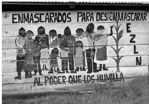
Masked, in order to unmask the power we brought down.

Due to the ban on political parties and throughout years of massive violation of civil and political rights, the independence movement was denied rep-